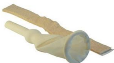
Image of Uridome

NOTE: The Uridome is usually applied after daily bathing/showering.