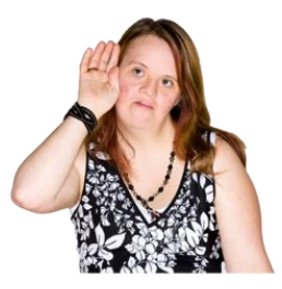
Not gossip or break privacy