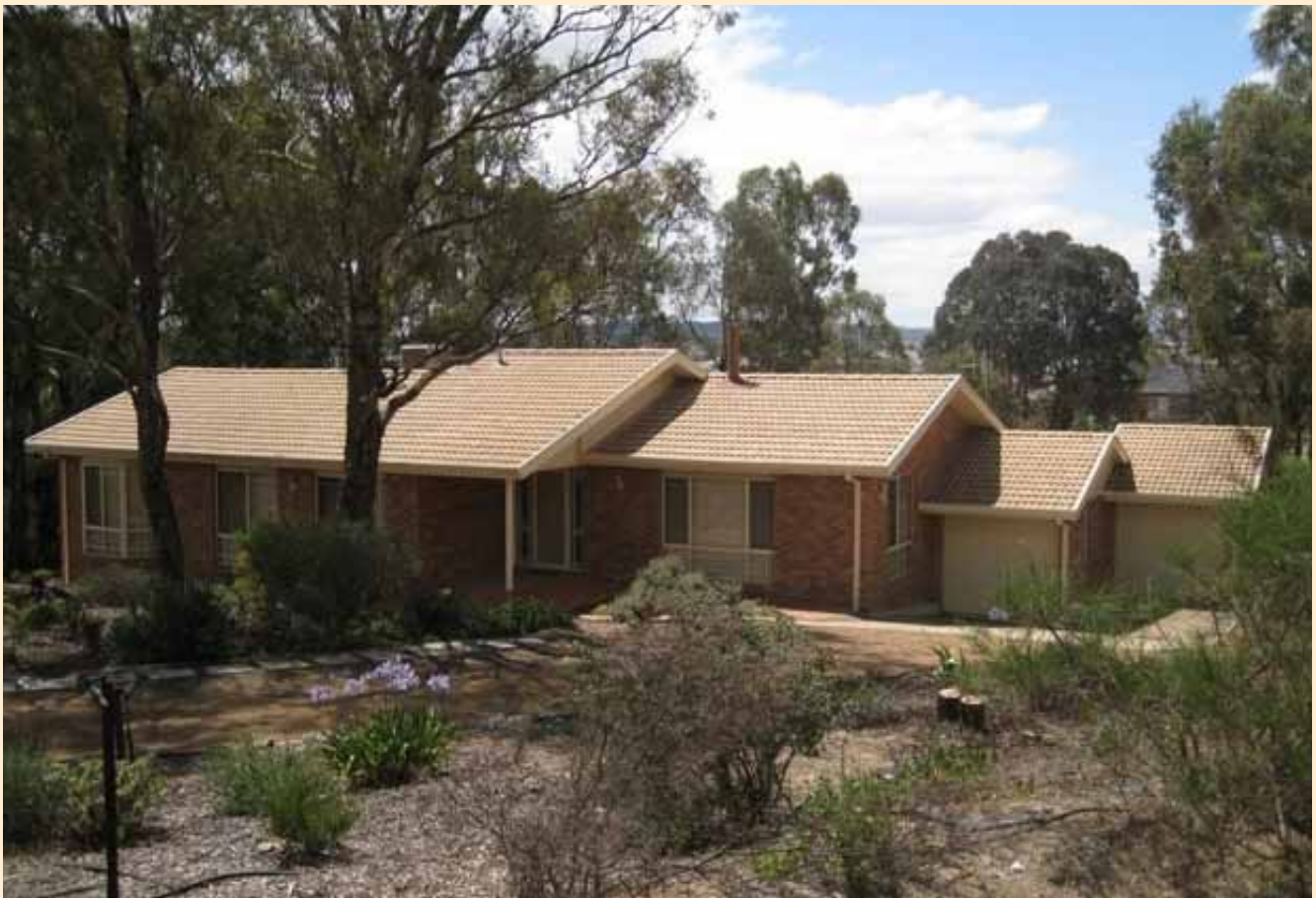
Moudji (friend for life) Respite Centre