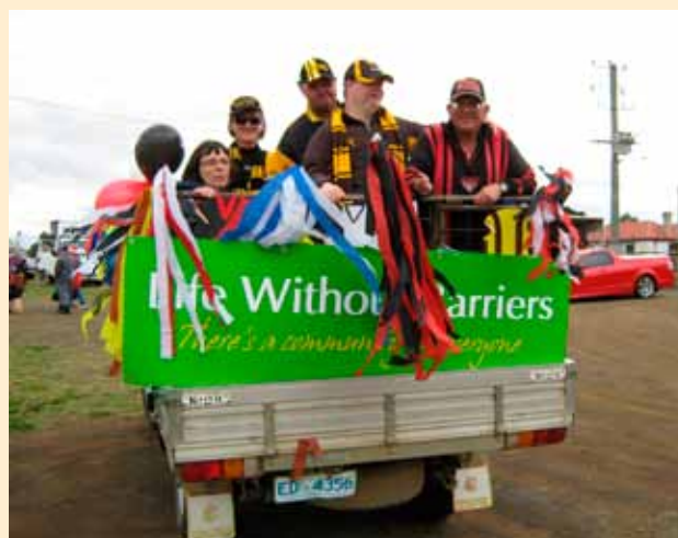
Footy Fever Float

The Footy Fever float entertained the many onlookers who lined the footpath, as it followed the Tasmanian Police Pipe Band into the Village Green where the local Rotary Club hosted a barbeque.